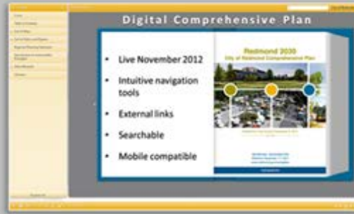
Digital Comprehensive Plan

Importantly, what Redmond has done is replicable in communities across the state. For example, many communities already have their comprehensive plans and zoning codes online, but are not taking advantage