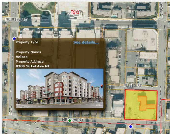
Property Viewer displaying property for lease

Also fully updated in 2011, Redmond's Zoning Code is now exclusively in digital format, with enhanced navigation and search tools. The integrated property viewer not only provides access to standard map information, it allows users to look up land use and development regulations, map the City by land use type, and view commercial property listings.