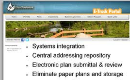
E-Review / E-Track