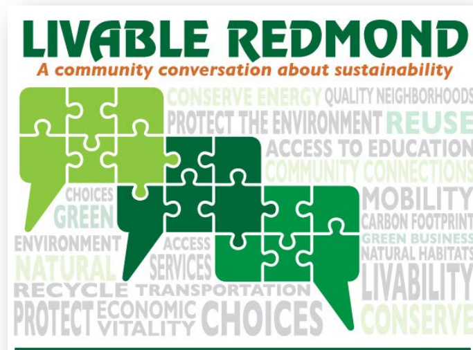
Invitation to Livable Redmond

The City engaged a broad range of stakeholders over the course of developing the Digital Suite . Redmond undertook a GMA-required Comprehensive Plan update in 2010-11. That process included multiple community-wide meetings, such as the Livable Redmond event, as well as a series of hearings with the Planning Commission (see also Mr. Gregory's endorsement letter). Once the content was adopted, Planning staff